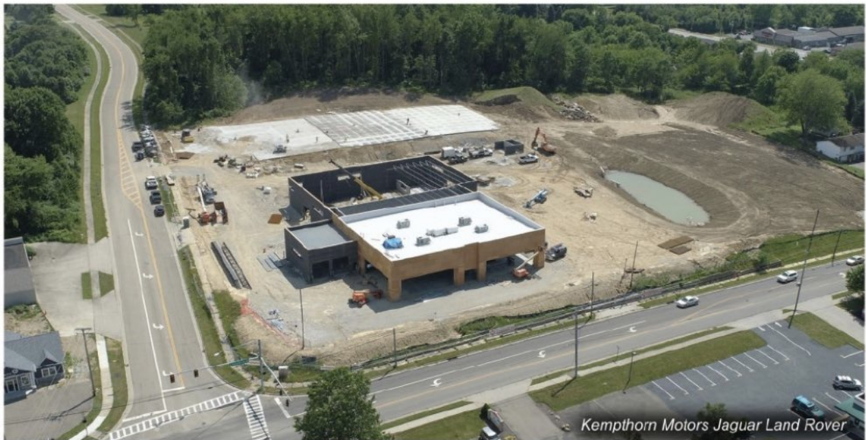
Kempthorn Motors Jaguar Land Rover

8040 Whipple Ave. NW, North Canton, Ohio 44720 Phone 330.244.9745 Fax 330.244.8794