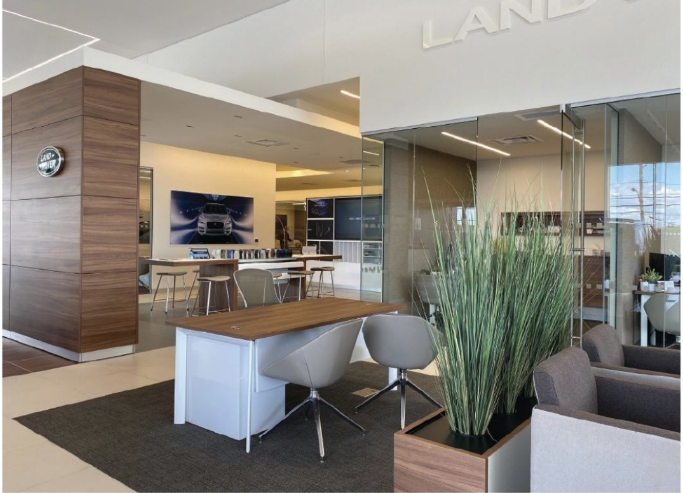
CUSTOMER COMFORT The front-of-house portion of the facility includes spacious showrooms, several glass-walled offices, a series of open workstations and comfortable seating for guests.

“Jaguar Land Rover has very strict prototypical requirements, so in large part the layout and the design is driven by those requirements,” Kaldy says. “The typical prototype is an all-metal building, but this facility is a little different because there were also some requirements from the City of Green. Because of that, the building incorporates a good deal of exposed masonry with an accent split-face block and a four-inch-tall CMU around the exterior.”